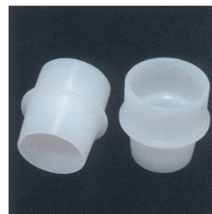
SPIROMETRY FILTER ADAPTORS

- Ø 27 mm Code: 30841 - Ø 29 mm Code: 30842 Quantity/box: 100 pcs.