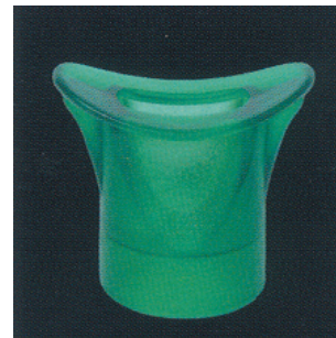
"PLUS" ANATOMICAL MOUTHPIECE

Spirometry Filter + "Plus" Anatomical Mouthpiece Code: individually packaged 30821 Code: bulk packaged 30822 Quantity/box: 50 pcs.