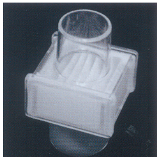
25/31 FILTER with pleated membrane

Dead space: 48,30 cm 3 Filtration area: 95,76 cm 2 Cross Contamination Reduction Efficiency: 99,99% Code: 30801 Quantity/box: 100 pcs.