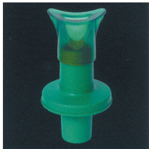
SPIROMETRY FILTER "PLUS"

Dead space: 48,30 cm 3 Filtration area: 95,76 cm 2 Cross Contamination Reduction Efficiency: 99,99% Code: 30801 Quantity/box: 100 pcs.